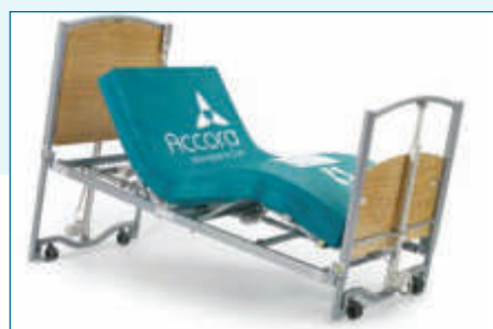
Trendelenburg and anti-Trendelenburg