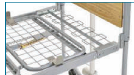
Mattress platform extension – increasing length to 84 inches