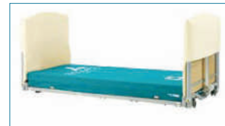
Head and foot board bumpers