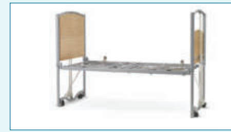
No trailing wires