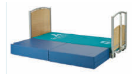
Safety mat provides same height as a FloorBed™ with 6 inch foam mattress