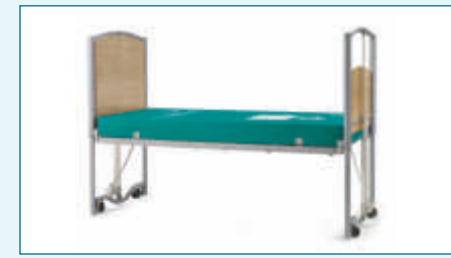
Full nursing height