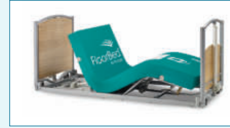
Backrest and kneebreak functions