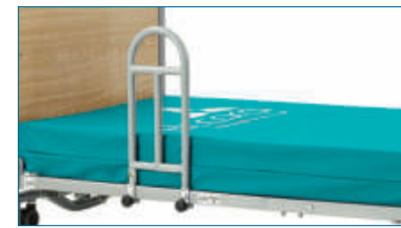
Assist bar to assist with bed mobility