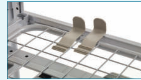
Width adjustable mattress guides