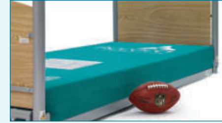
Mattress platform height of just 2.8 inches